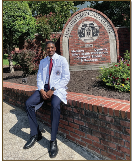
Current Scholar MEHARRY DENTISTRY

Through its dual focus on community engagement and healthcare workforce development , Health Legacy of Cleveland is uniquely positioned to create meaningful, measurable, and sustainable improvements in the health and well-being of communities throughout Northeast Ohio.